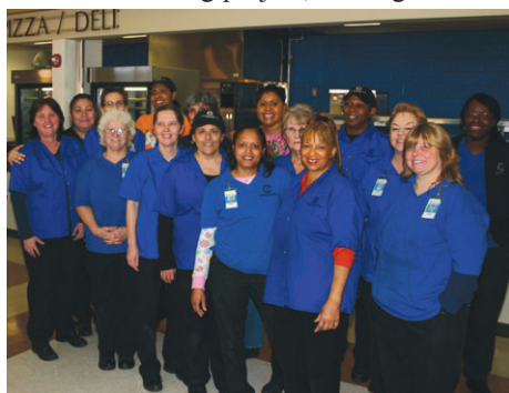
Food Service Staff gathers at the cafeteria dedication.

The cafeteria is the first phase of a huge SPLOST building project, the largest in the